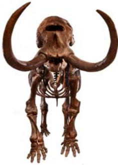
Illustration by Velizar Simeonovski

This sketch shows a Columbian mammoth, an African elephant, and an American mastodon (from back to front) next to a 6-foot-tall human.