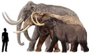
Illustration by Velizar Simeonovski

This illustration shows four female woolly mammoths in their herd. Fossil records indicate that herds consisted of adult females and young calves. When male mammoths reached young adulthood, they left their herd.